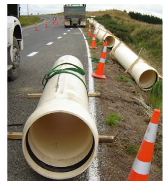
DN575 (630mm OD) PN9 WHITE RHINO™ for a wastewater outfall, installed under a sealed road, Edendale, Southland.