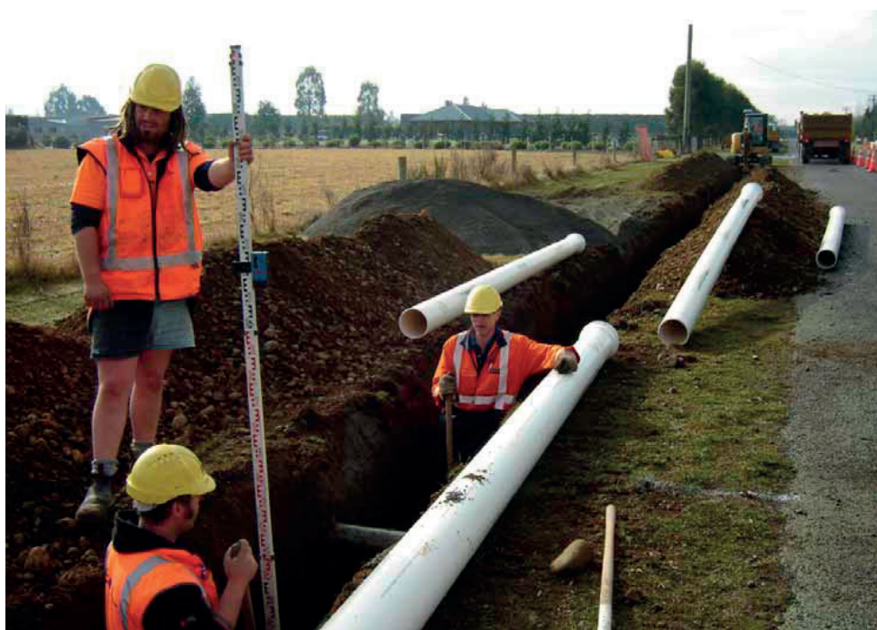
Installation of NOVAKEY™ Series 1 PN 12 pipes, in a road berm near Ashburton, with laser assisted control of the trench depth and grade.