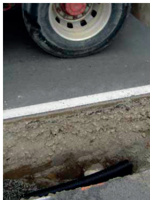
Iplex NEXUSFLO interceptor drain installation under the berm of an arterial commercial/industrial roading environment, Tremaine Avenue, Palmerston North City.

Installation: Iplex NEXUS HI-WAY products should be installed in accordance with NZTA specification TNZ F/2.