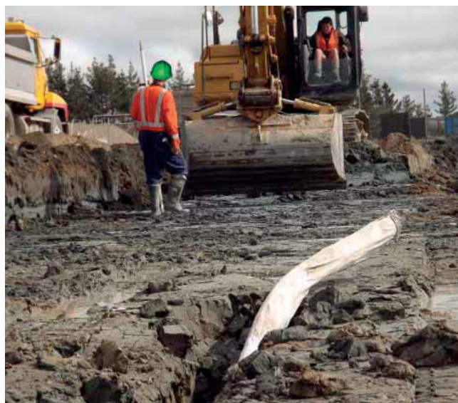
Iplex NEXUS HI-WAY with factory-fitted filter sock being installed in preparation for access road construction, commercial estate development, Longburn, Manawatu District.