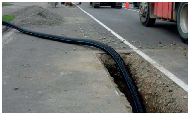
Iplex NEXUSFLO interceptor drain installation under the berm of an arterial commercial/industrial roading environment, Tremaine Avenue, Palmerston North City.