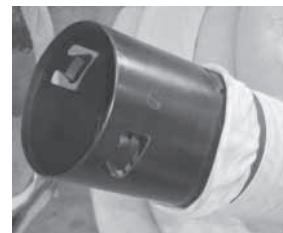
Iplex NEXUSHI-WAY pipe coil showing the pipe fitted with filter sock