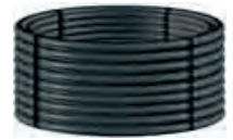
BLACK PE PIPE WITH LILAC MULTI-STRIPE