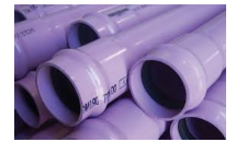
LILAC PVC-U PIPE WITH RUBBER RING JOINT