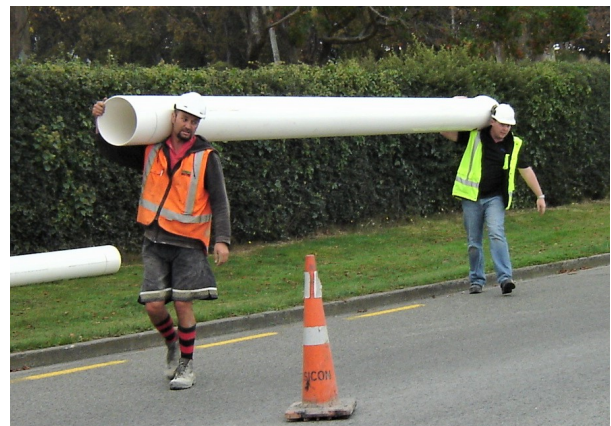
Manual site handling of DN 300 PN 12.5 Iplex Apollo pipe, Timaru City