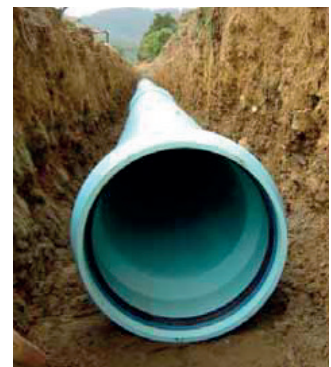
DN525 PN12 BLUE RHINO™ in trench ready for backfilling, under sealed road near Levin.