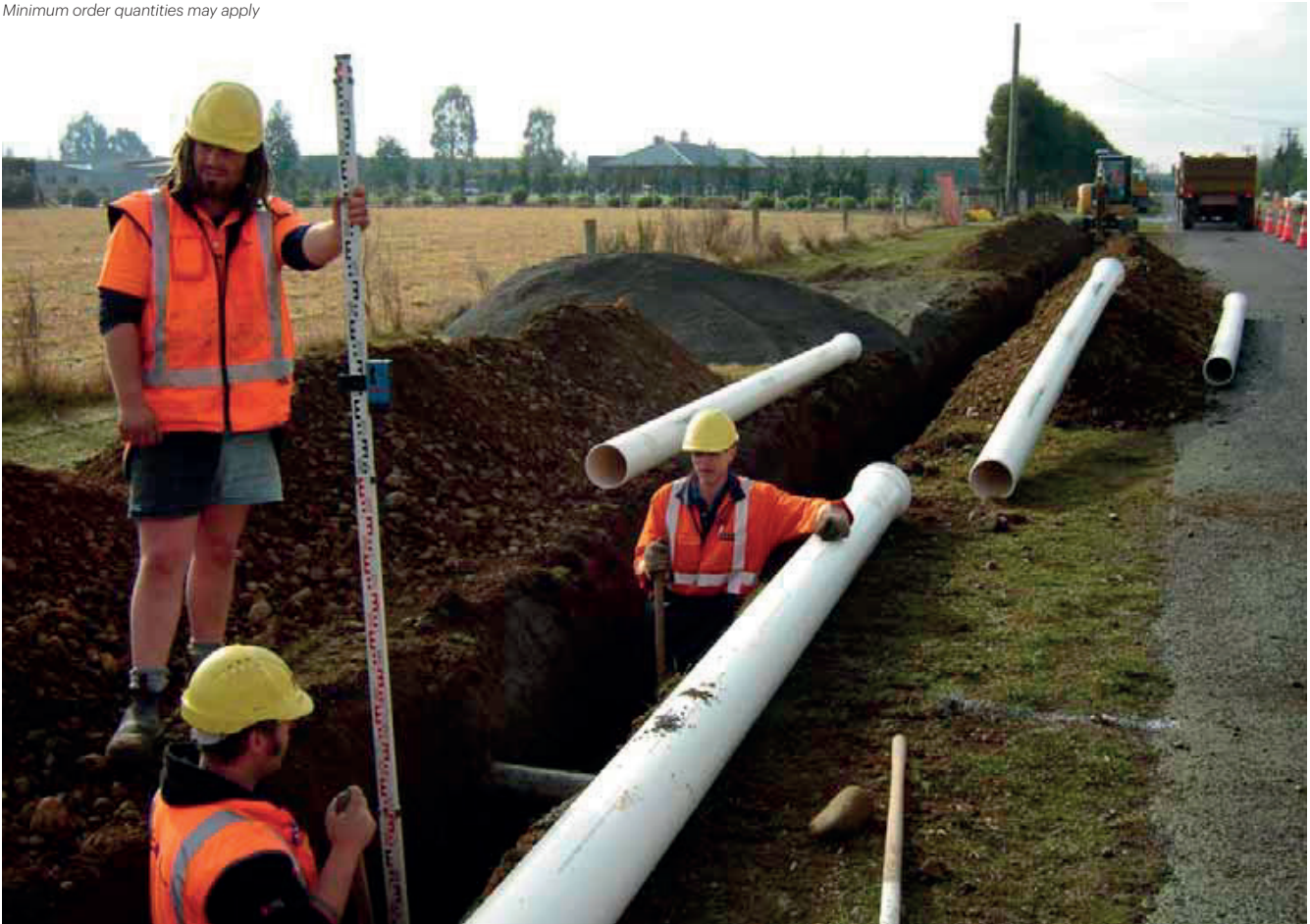
Installation of NOVAKEY™ Series 1 PN 12 pipes, in a road berm near Ashburton, with laser assisted control of the trench depth and grade.