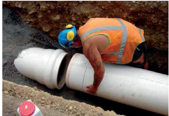
Joint assembly on NOVAKEY™ DN 450 PN12 watermain under a sealed main highway.

Length: 6 metre effective length. Length of the witness mark is added to give the overall length.