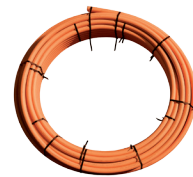
Coiled PE Cable Duct