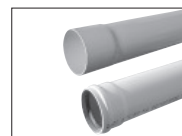
SOLVENT CEMENT & RUBBER RING JOINT